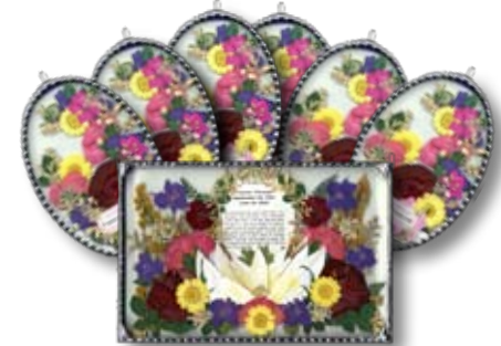
Package 2 $350.00