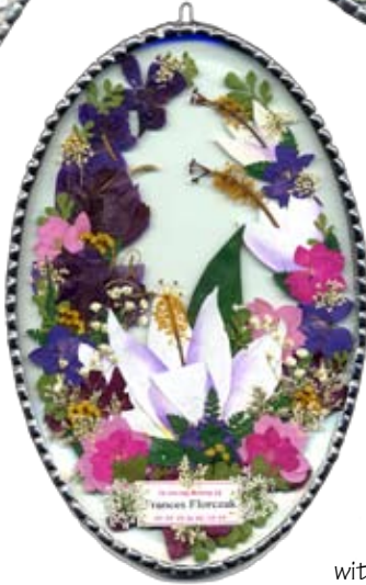
6x9 Oval with plaque, and decorative edge