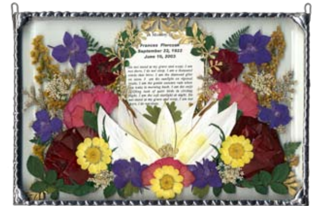
6" x 9" Rectangle, with prayer card, and decorative edge