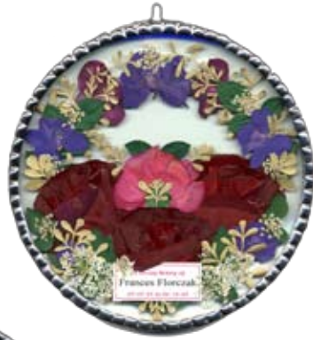
6" Circle with plaque, and decorative edge