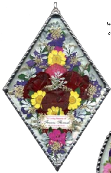
6x9 Diamond with plaque, and decorative edge