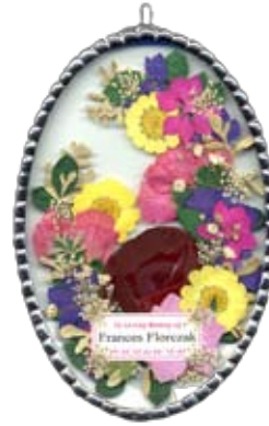
4" x 6" Oval with plaque, and decorative edge