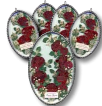
Package 1 $247.00